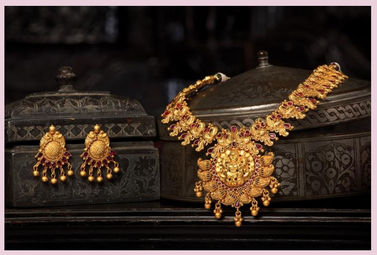
Indian Fashion Jewellery

Online shopping has been trending and every individual is engaged in shopping for online products and services. You must collect the information while purchasing jewellery and be aware of how to clean the jewellery. If you are looking for the best online shop for cleaning the jewellery you must search for the online number of online jewellery shops that are engaged in providing cleaning materials with the jewellery instruction.