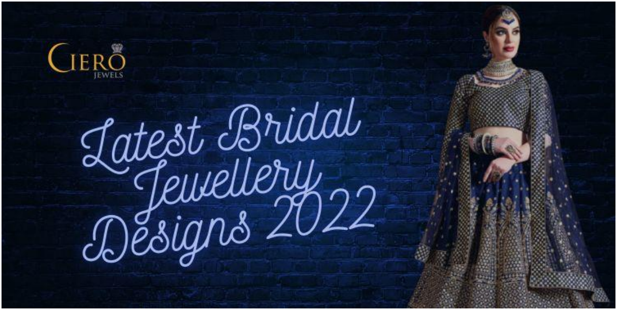
bridal kundan jewellery online

The big giants provide the products by eliminating the earning advantage of the deserving sellers. Sometimes, you might also be influenced to buy various untrendy products from these websites because of the bulk storage quantities present in their stores or warehouses.