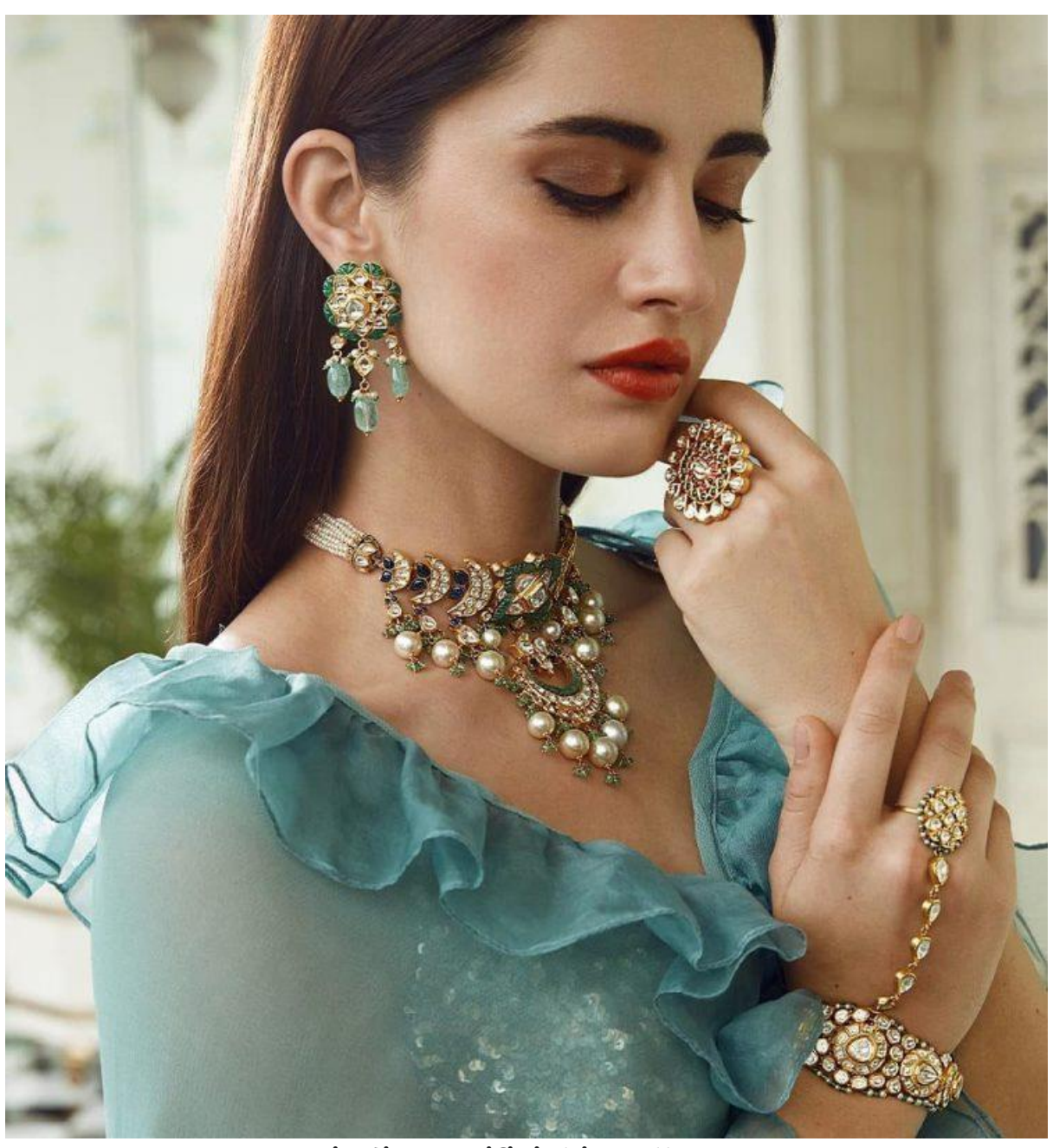
indian artificial jewellery

The price is not a big concern, as it's directly proportional to demand and supply theory. We all must come together and buy from the deserving players in the market. A balanced approach of expanding in offline and online markets will ultimately help in bringing a boom in both the fields.